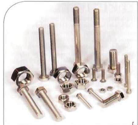
The new venture will produce various fasteners