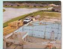
EBS ... design-friendly

EBS Structural Concrete Forms, a proprietary construction system conceived by the US-based Efficient Building Systems (US pavilion Stand C423), has been launched on the Gulf market at The Big 5 show. These concrete forms cover bearing and non-bearing walls, floors and roofs, and have the flexibility to adapt to almost any design that can be conceived for concrete.